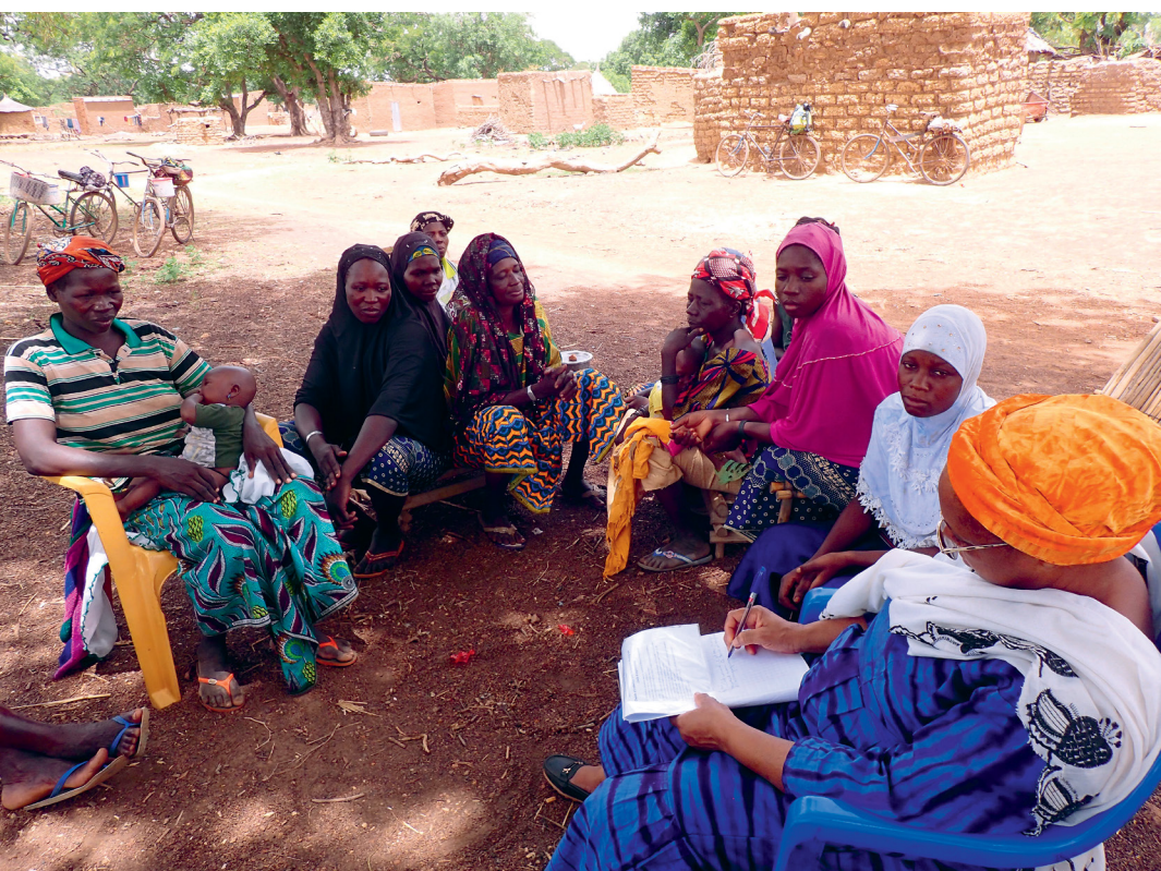
Photo 4: Focus group discussion with migrant women to understand their specific challenges in investing in soil protection, Bouéré, Burkina Faso