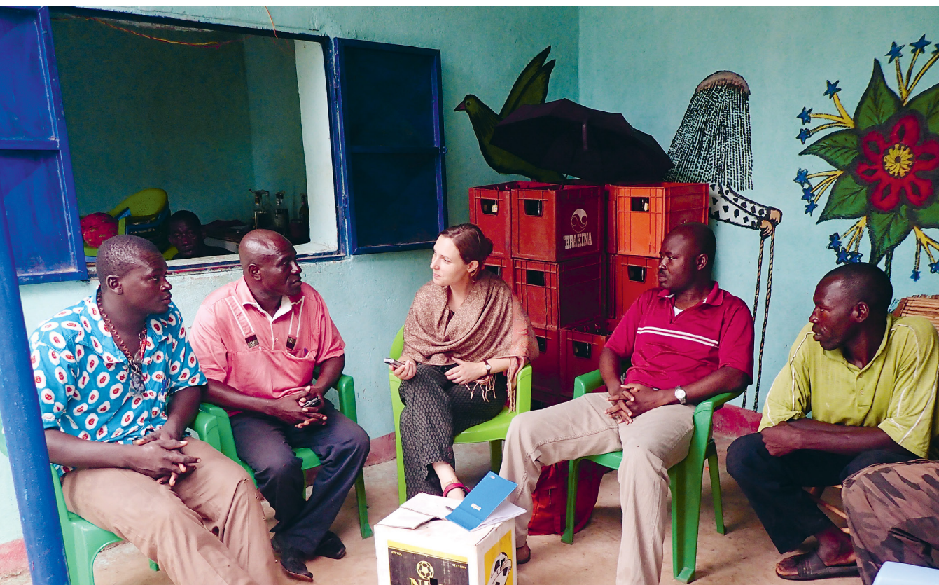
Photo 1: Focus group discussions with smallholder farmers