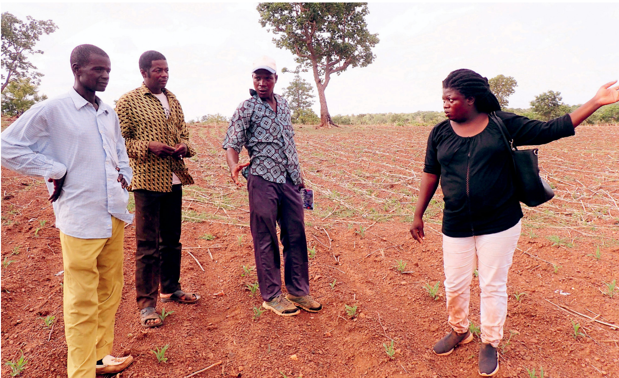
Photo 3: Female extension agent with male farmers in Bouéré, Houde district, Burkina Faso – a rare picture

Soil protection starts with knowledge. Gender-discriminatory norms, attitudes and behaviours that limit women's access to information need to be challenged.