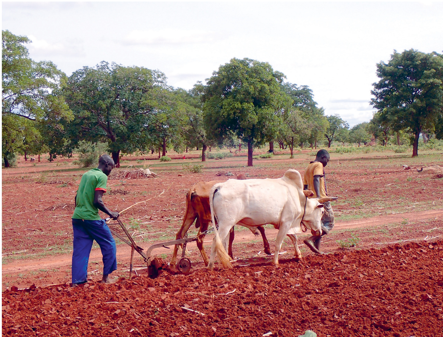
Photo 2: Young men ploughing the field with oxen on the family field in Tiarako, Burkina Faso